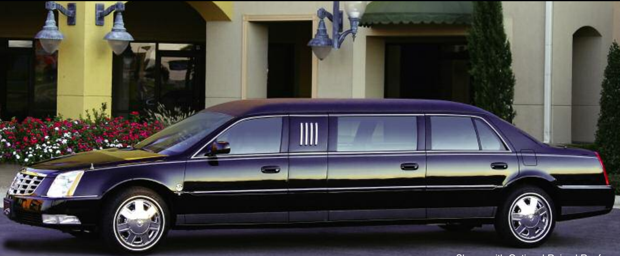
Shown with Optional Raised Roof